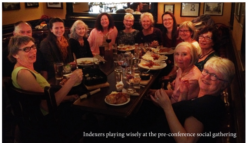
Indexers playing wisely at the pre-conference social gathering