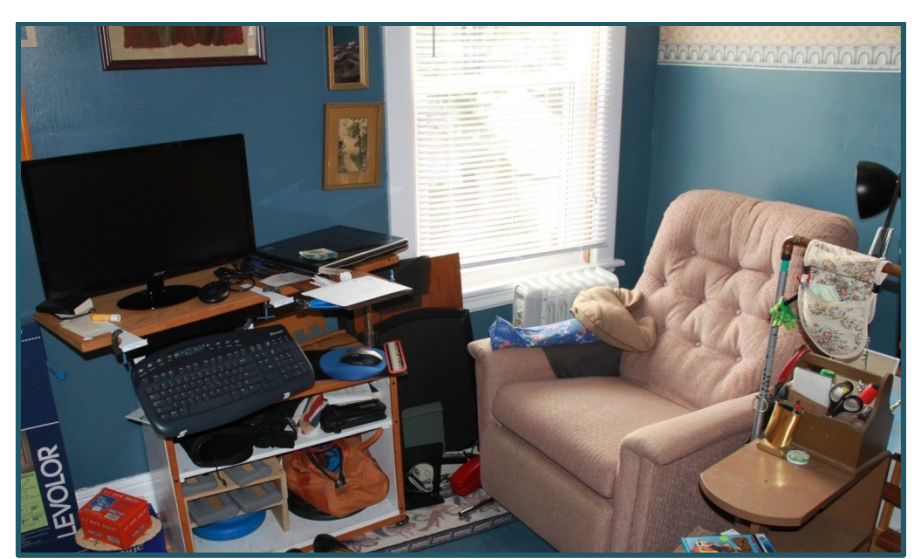
Figure 3: The recliner arrangement, opened up to show how it is organized.

For a second work-posture variation, I improvised a swing-arm table assembly holding a laptop fitted with an added keyboard and monitor. This enables me to work in a recliner (see Figures 3 and 4). The benefit is that any strain on the lower back and tailbone is greatly eased. In this position I have yet to perfect the best method for mouse usage. I find that wrist and forearm tire much more quickly than while working at the desk, so obviously the profile is not the best. But it works well for when I am proofreading scanned text against digital format, and for editorial tasks associated with indexes, in which mouse use is more restricted. Still, I have a confession: while both of these arrangements work well enough (with some limitations), I find that I instinctively prefer the sit-down posture. Habits do die hard!