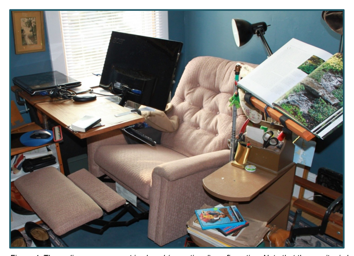
Figure 4: The recliner arrangement in closed (operational) configuration. Note that the monitor is located immediately above the keyboard and tilted for optimal viewing pleasure.

For a second work-posture variation, I improvised a swing-arm table assembly holding a laptop fitted with an added keyboard and monitor. This enables me to work in a recliner (see Figures 3 and 4). The benefit is that any strain on the lower back and tailbone is greatly eased. In this position I have yet to perfect the best method for mouse usage. I find that wrist and forearm tire much more quickly than while working at the desk, so obviously the profile is not the best. But it works well for when I am proofreading scanned text against digital format, and for editorial tasks associated with indexes, in which mouse use is more restricted. Still, I have a confession: while both of these arrangements work well enough (with some limitations), I find that I instinctively prefer the sit-down posture. Habits do die hard!