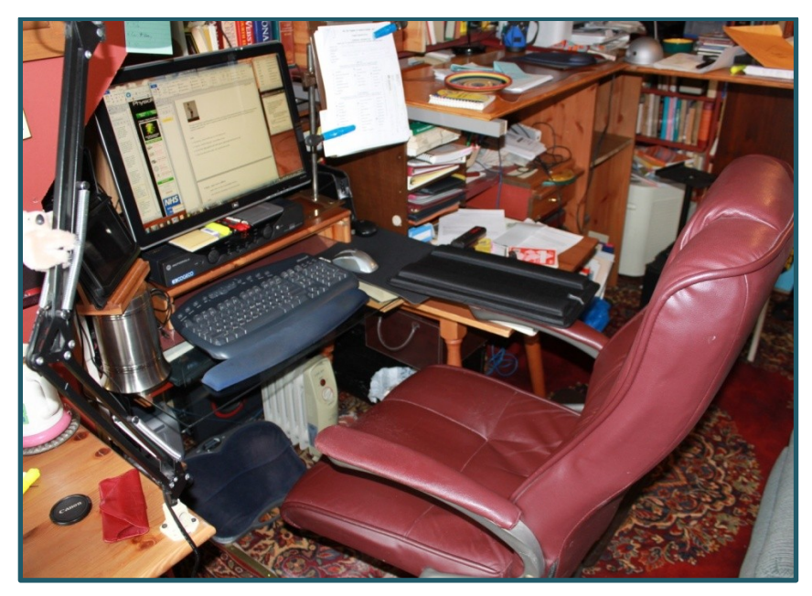
Figure 1: My workspace, showing an inclined footrest, the extended right armrest to support mouse usage, and the gel-pad wrist rest in front of the keyboard.

What follows now is beyond the norm, but I found these expedients helpful for the back-pain incident that prompted these investigations. When my discomfort got to the point where I just couldn't sit in front of a monitor any longer, I retired to a recliner. After several weeks I had found relief and returned to the desk. But I had also decided that some variety was warranted. Over several months of experimentation I came up with two alternative work postures. The first involved a desk arrangement that allows for working while standing (see Figure 2). I have since read that some folks have combined a stand-up desk with an electronic treadmill arrangement. The drive-belt speed is set low enough to provide for continual body motion without distracting overly from the work at hand. I haven't tried that one.