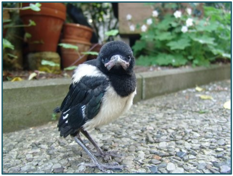
A young magpie. Photo by Dirk Baunack available for free distribution worldwide under the German Wikipedia Project.

Indexing Theory and Application (X477) is part of the UC Berkley extension program and is a standalone course. Further information can be found on the Berkeley website at <a href="http://extension.berkeley.edu/catalog/course394.html">http://extension.berkeley.edu/catalog/course394.html</a>, and on Sylvia Coates's webpage on the course, at <a href="http://www.sylviacoates.com/uc-berkeley-extension-indexing-course.html">http://www.sylviacoates.com/uc-berkeley-extension-indexing-course.html</a>.