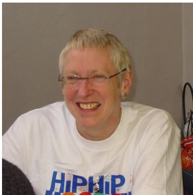
Our fearless leader enjoying the social life in Calgary.